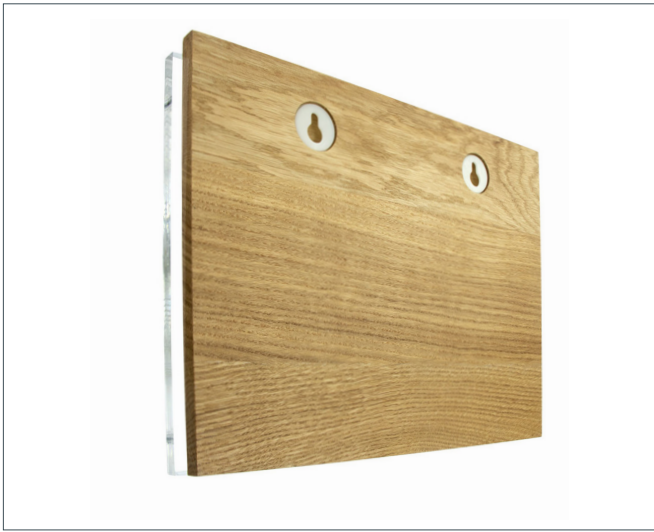
Rear wall slots