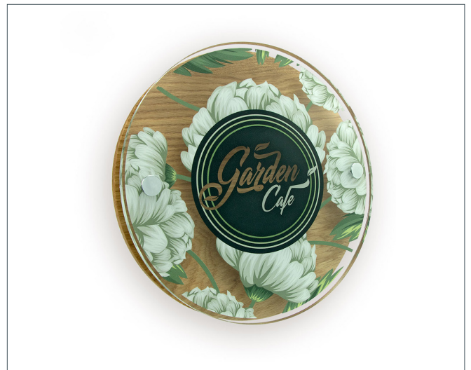
Woodline Basic (Round)

*nb. Wood products may vary to that shown. Being a completely natural material, it varies in colour, blemishes, grain and other inconsistencies - it adds greatly to the individuality of each order.